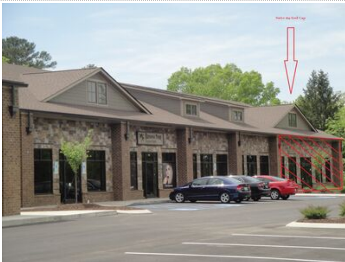
Outside Suite 119 Endcap